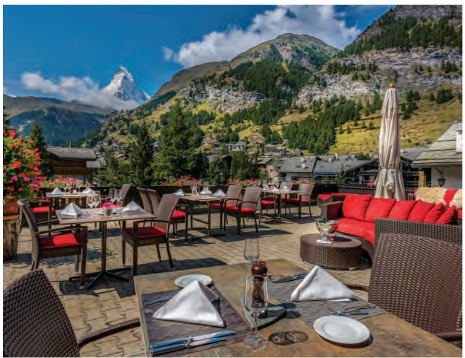
Hotel Christiania, Zermatt

A historic, chic property, the Grand Hotel Zermatterhof may well be the most prestigious hotel in Zermatt. Positioned in the centre of the village, it is just a minute's walk from the main church, a park, the best restaurants in Zermatt, and the Matter Vispa. The rooms blend state-of-the-art comfort with regal charm.